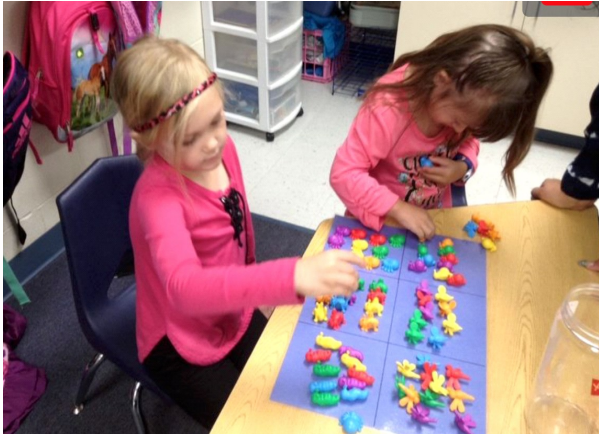
Practicing our sorting skills during Math.

Here are just a few things that we are doing in the kindergarten room.