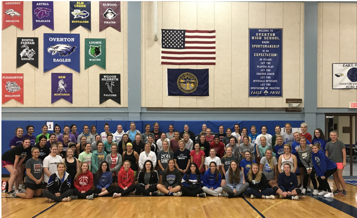
FKC alumni participants, players, and the Overton volleyball team

On Saturday, October 13 th the annual Overton alumni tournament was held at Overton Public School. Players and teams from around the conference came to participate. The Overton volleyball team helped with lines, score keeping, keeping the bracket up to date and keeping the tournament running smoothly. Six area FKC schools were represented at the tournament. A big thanks to everyone that took part in the day to make it a success!