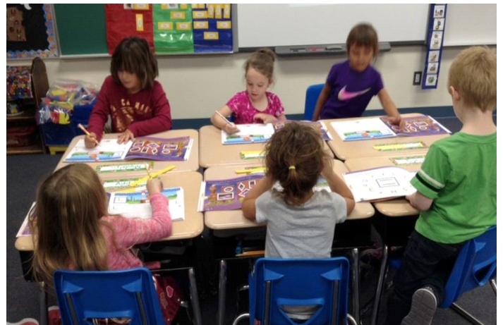
Practicing our letter formations in Handwriting.