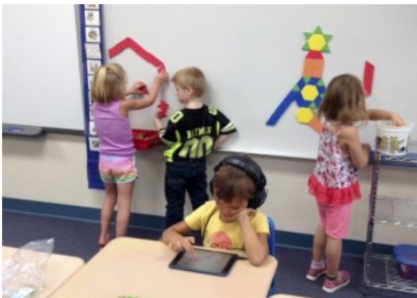
Center time we work on our social skills and sharing. We have 6 centers that we rotate through.