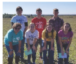
District Land Evaluation competitors