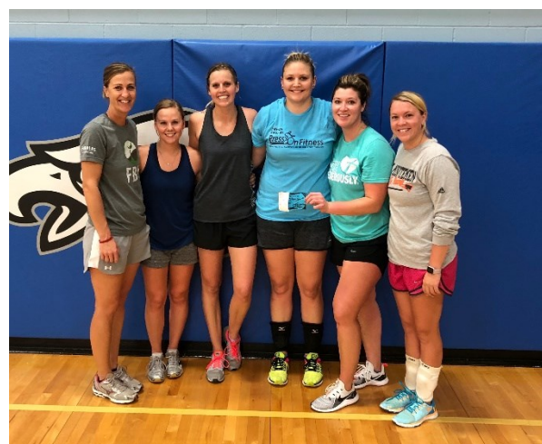
FKC tournament champ! WTG