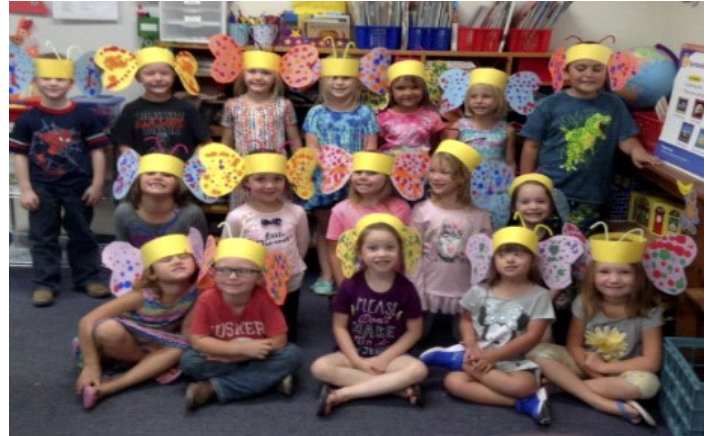
We made our own butterfly wings after watching our caterpillar turn into a butterfly.