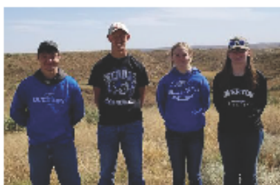
State Range Judging competitors