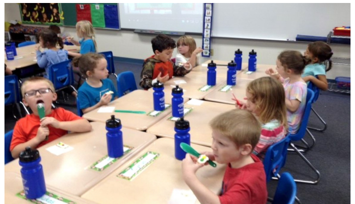
During Social Studies we talked about safety signs. Here we are making edible traffic lights.