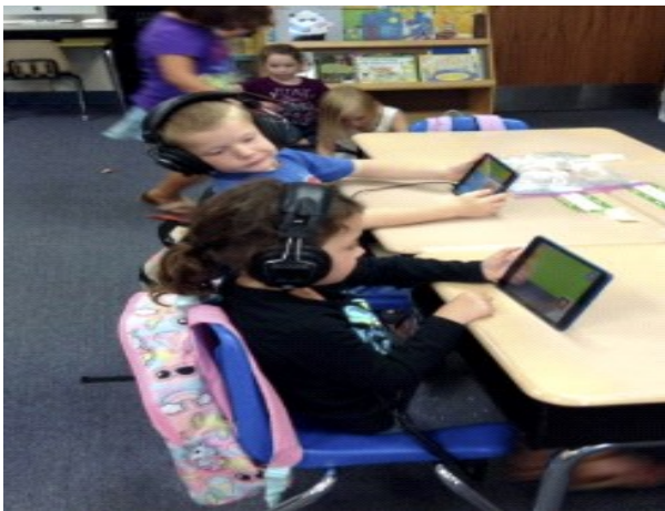
Using the iPads to work on IXL. We use IXL for Language Arts and Math.